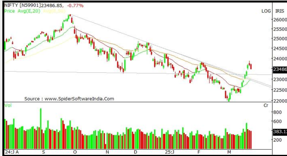
Daily Chart (23,486.85)