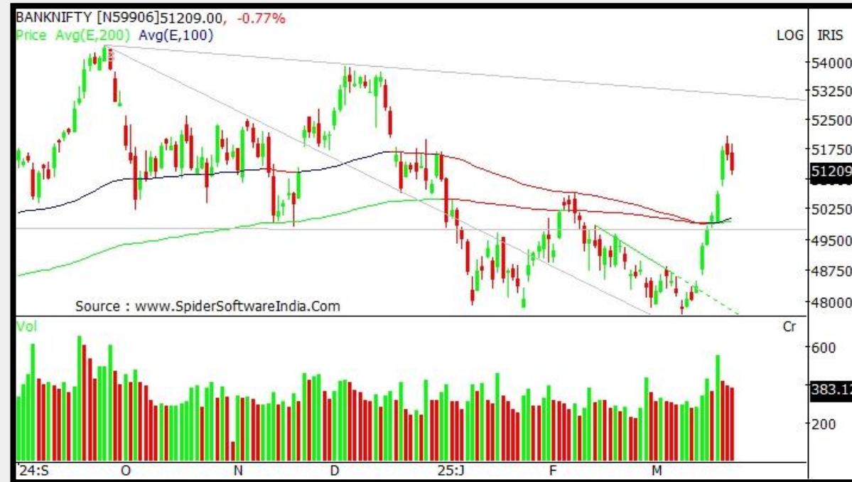
Daily Chart (51,209.00)